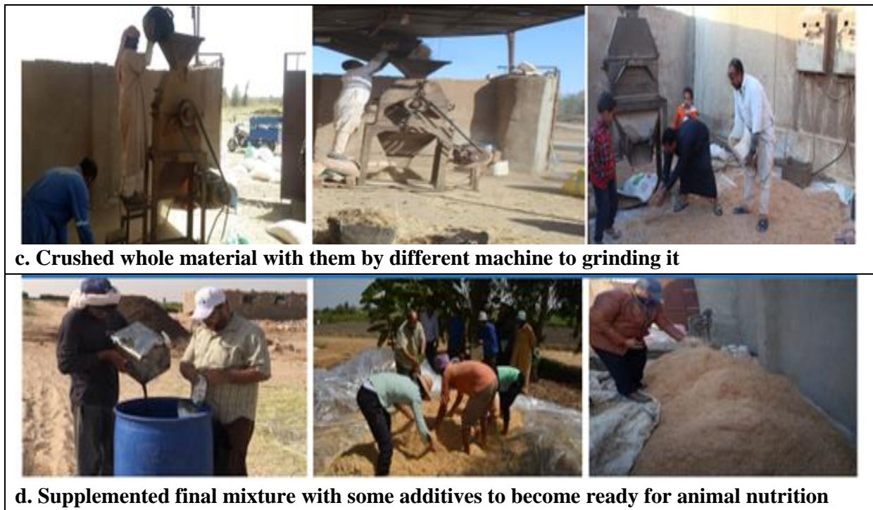
Fig. 1. Steps of total mixed ration (TMR) preparation.