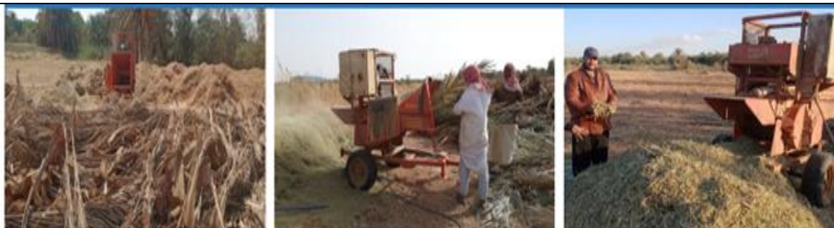
a. Collected chopped trimming waste of fruit trees into small pieces (1-3cm)

Also, providing feed as TMR has nutritional benefits such as the possibility to easily use by-products from the food industry (Gill, 1979 and de Souza et al. , 2019), home-grown protein sources, incorporated less palatable ingredients into the mix (Coppock et alet al. , 1981) as well as increase daily total dry matter intake compared with feeding roughage and concentrates separately (Nocek et al. , 1986 and Collier et al. , 2018).