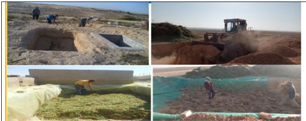
1. Silo preparation (different forms)

and enhance untraditional forages (e. g. trimming waste and vegetable thrones). Ensiling of these materials appeared to be the most convenient processing method and led to improving the quality of forage resources and enhanced their acceptability for ruminant nutrition under the prevailing conditions of aridity in Egypt (Abo Bakr et al. , 2020b).