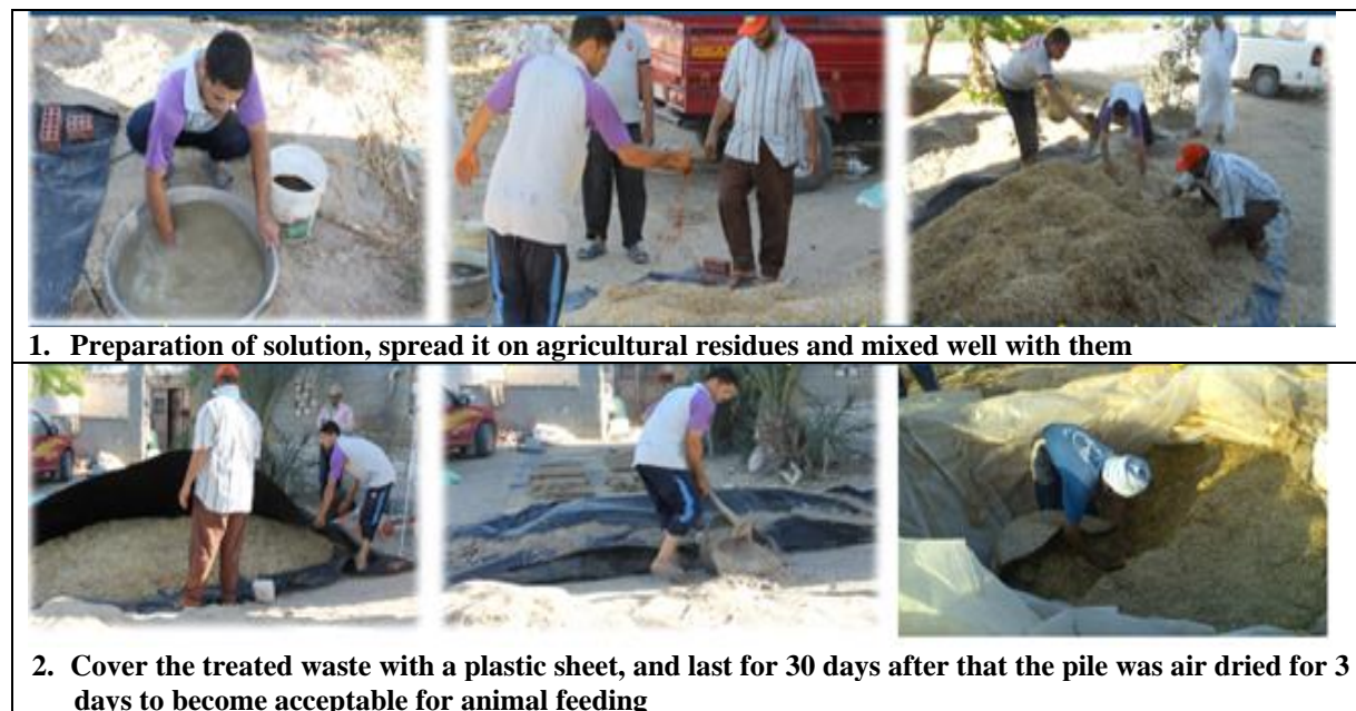
Fig. 3. Steps of covered stack feed manufacturing.

depth of 1.5m). It is advised to wrap the treated trash for thirty days using a polyethylene covering that is typically two millimeters thick. After that, the pile was turned upside down and well stirred each day as it dried in the sun for three days, allowing all the ammonia to be released and making it suitable for animal feeding (Abo Bakr, 2012).