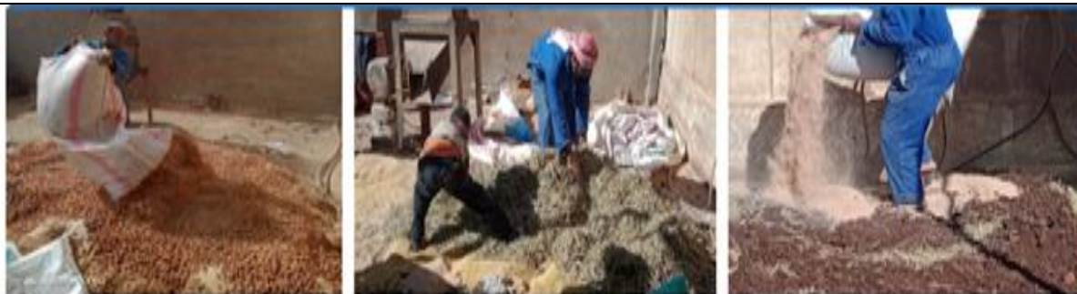
b. Mixing fibrous chopped materials with agro-industrial by-products