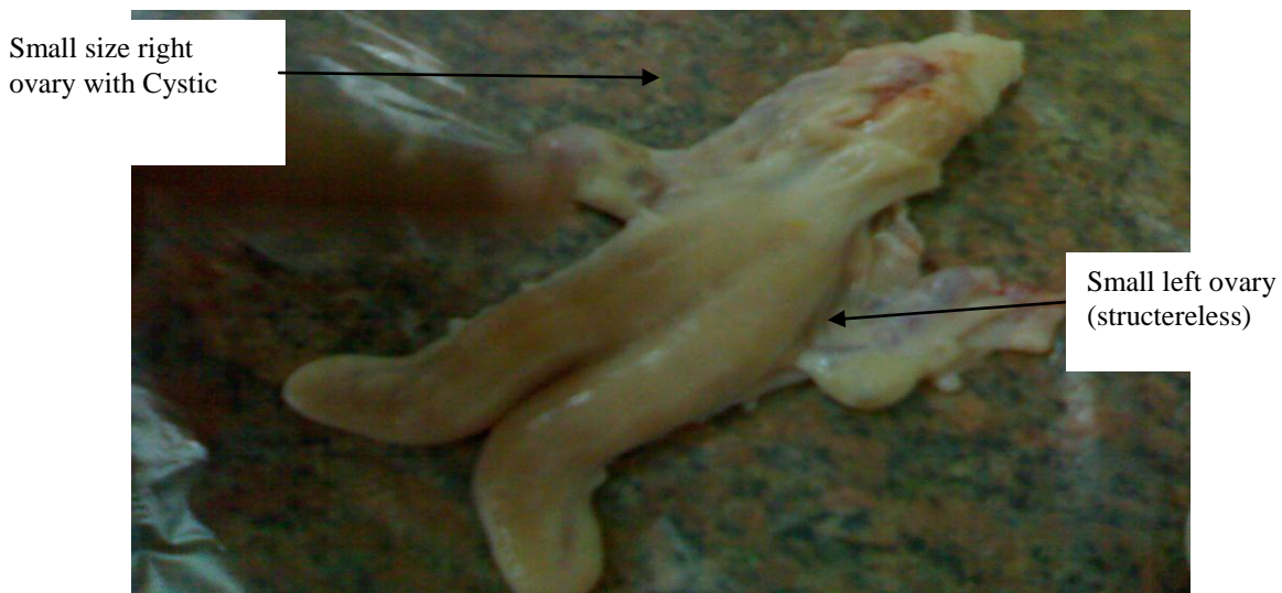
Plate 2. ILLUSTRATE THE MORPHOLOGICAL FOR EWES SCORED 1 BCS