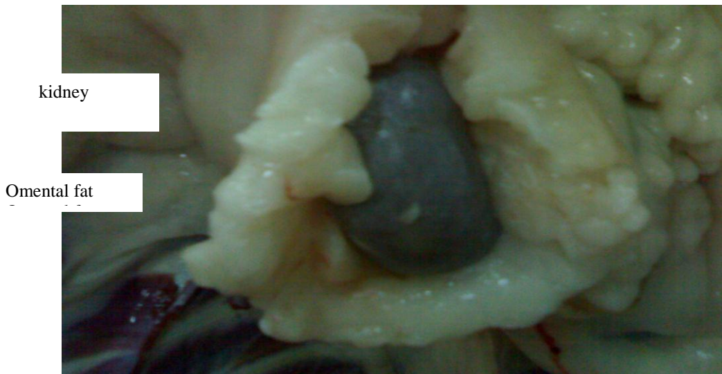
Plate 1. ILLUSTRATE THE MORPHOLOGICAL FOR EWES SCORED 5 BCS